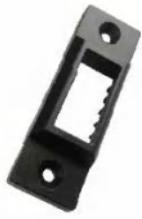
STPIKING PLATE Material: ABS Size: 73.3X24.5X12MM