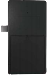
LOCK BODY: BF05 Material: ABS Size: 126X56X23.5mm Power Supply: 4*AA (alkaline battery)