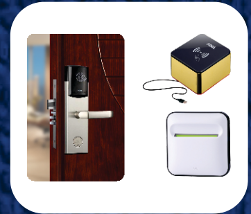
SMART HOTEL LOCK