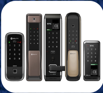
SMART DOOR LOCK