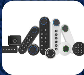
SMART CABINET LOCK